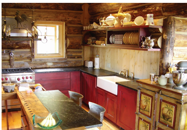
A kitchen like new, thanks to a Legacy-assisted remodel.

Mendota fireplaces operate at up to 50,000 BTUs and have the highest efficiencies (up to 86.4%) of any fireplace on the market.