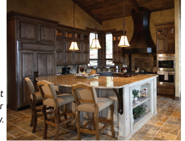
Winter Park, CO

The creativity and flexibility of Custom Cupboards to fit any situation can improve not only the appearance of your kitchen, but also the functionality.